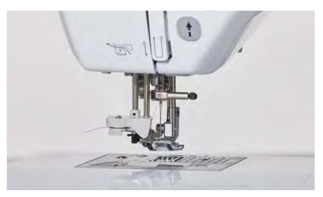
Advanced needle threader